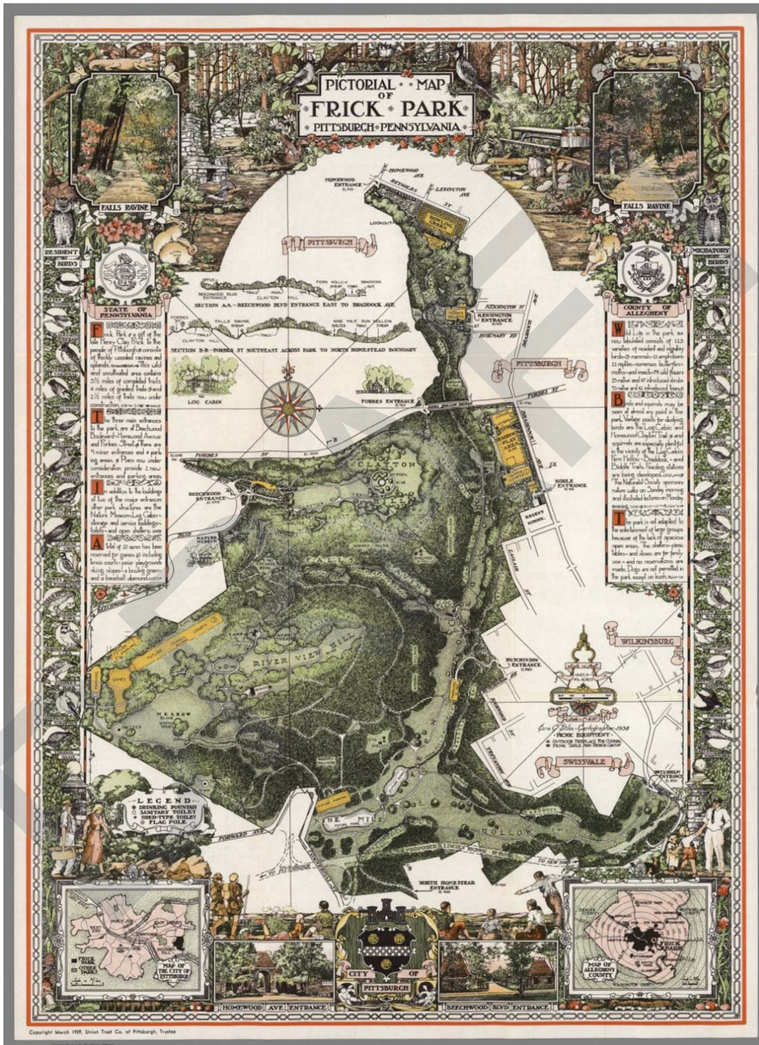
Figure 1. Frick Park Trustees' "Pictorial Map of Frick Park," 1939