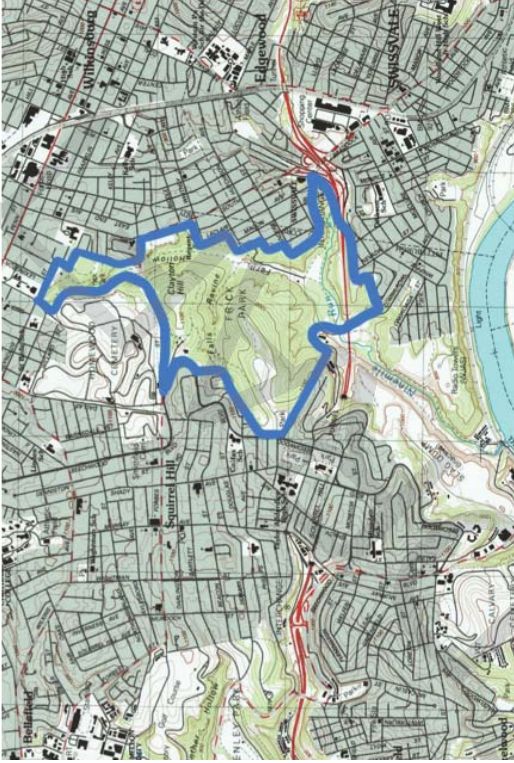
Frick Park Pittsburgh, Allegheny County