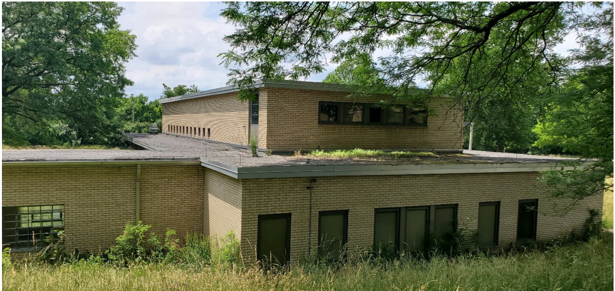
East façade partially submerged in hillside