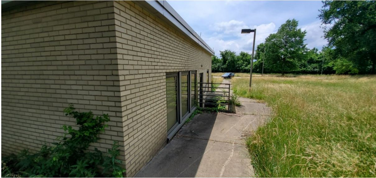
North façade, second entry with stairs