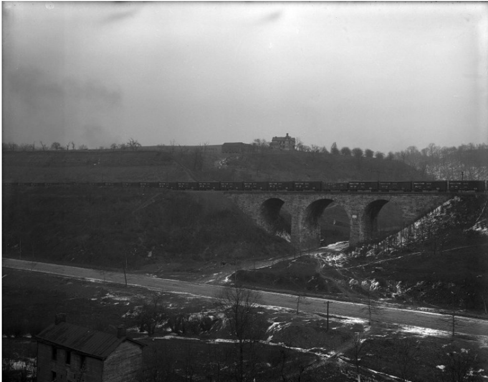
Figure 3 – Leech Farm, 1913