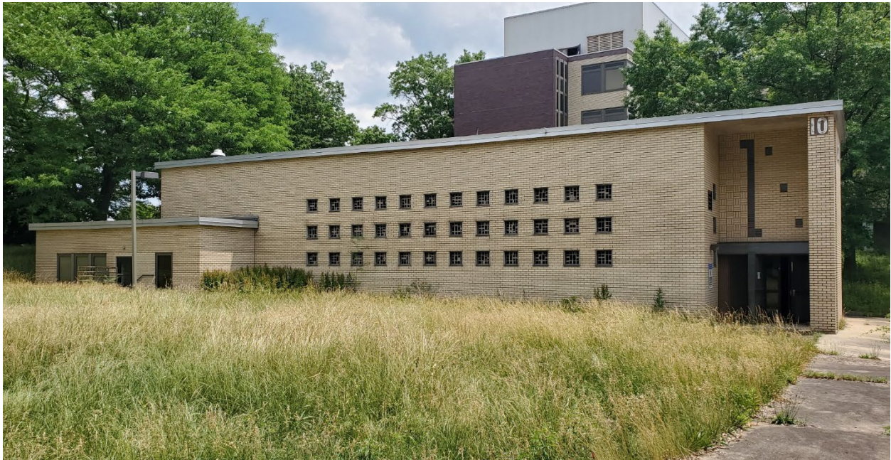
North Façade, slab glass windows