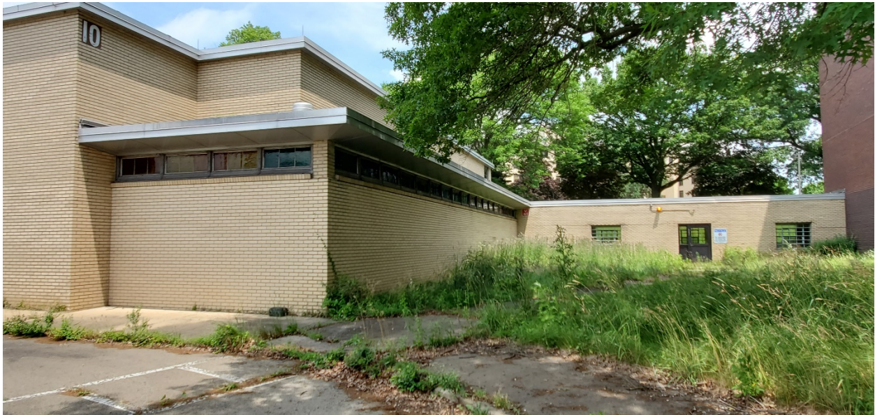
West façade, clerestory windows