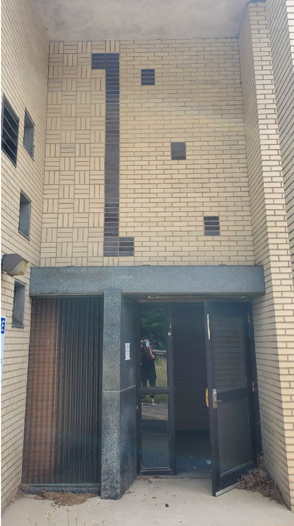
Entry façade decorative elements