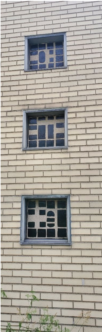
Slab glass detail