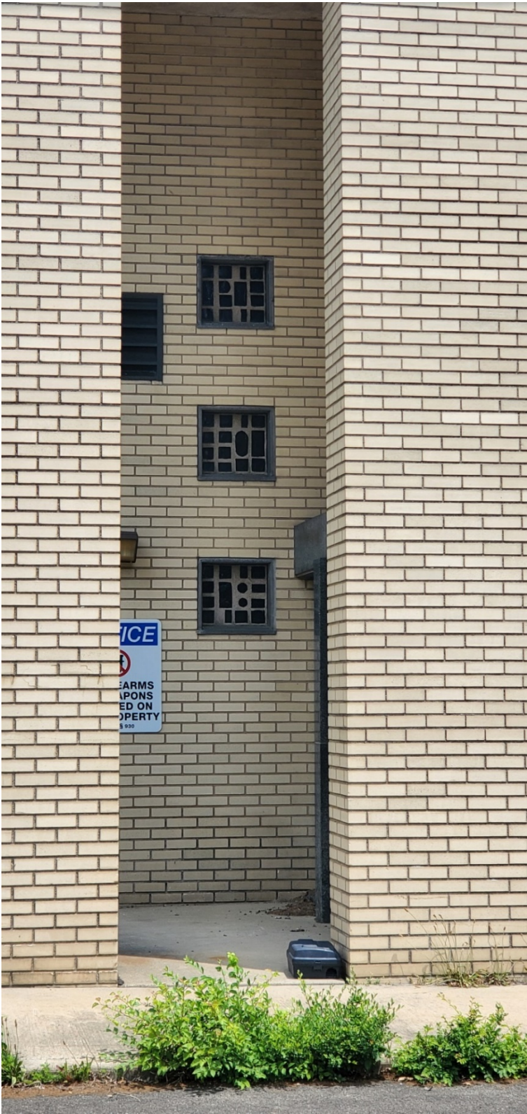
West façade, slab glass detail