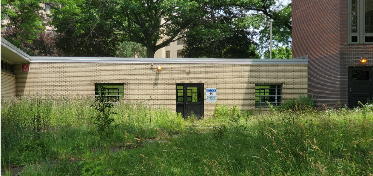
West façade, tunnel