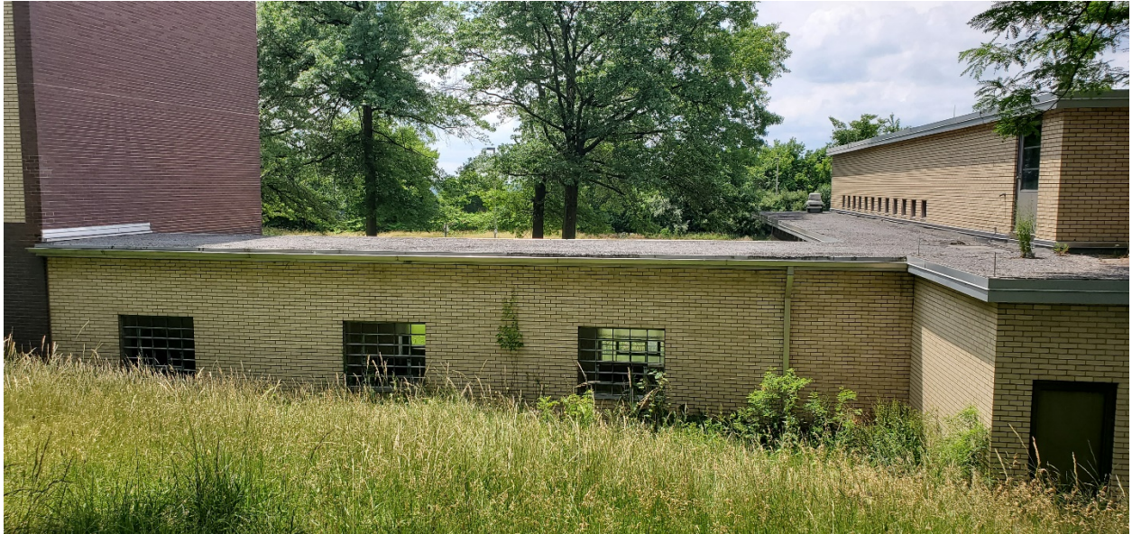
East façade, tunnel fenestration