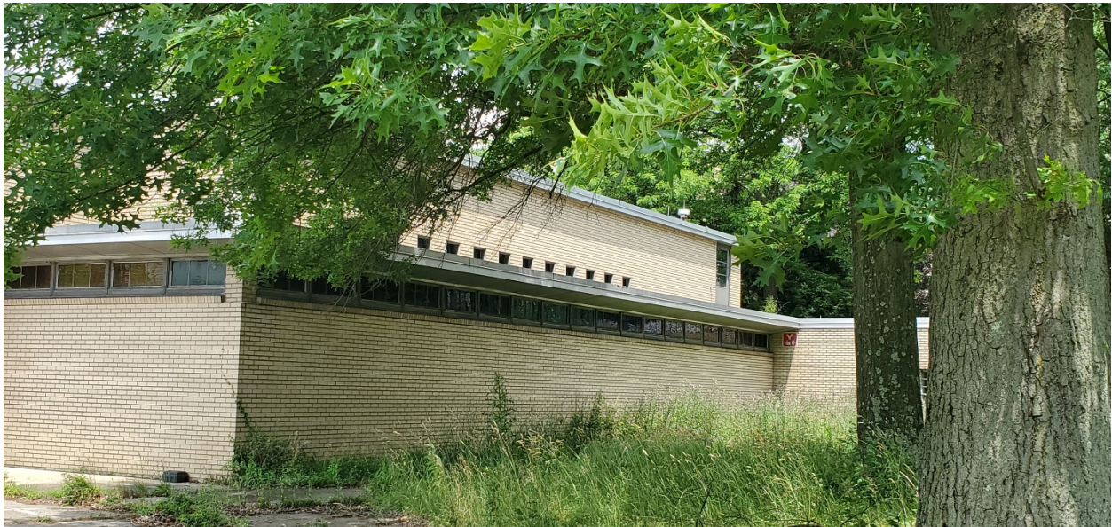
South façade, clerestory windows below overhang, slab glass windows above, door on far right out to overhang