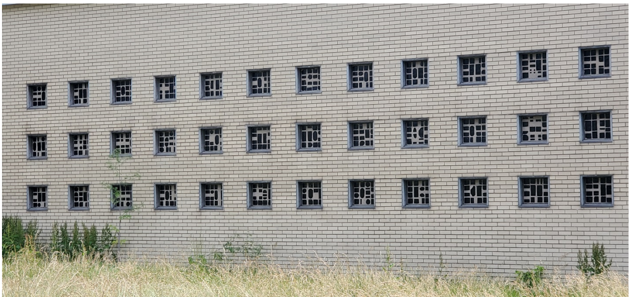
Slab glass, thick pieces of glass inset into concrete