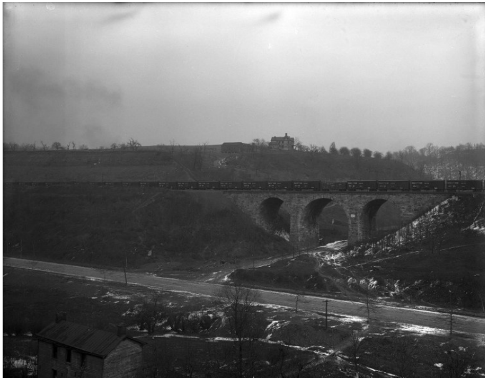
Figure 3 – Leech Farm, 1913