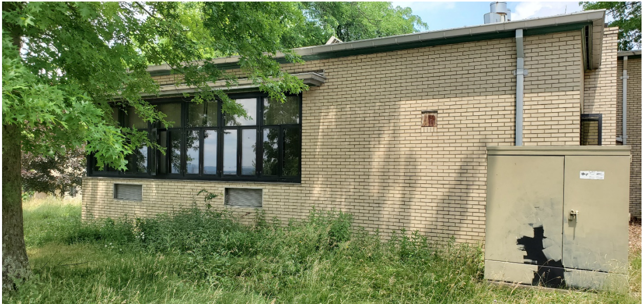
Southern elevation, one-story south section