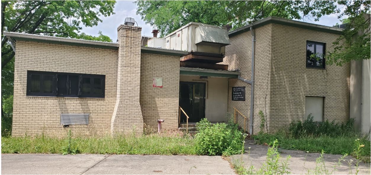
Eastern elevation, one-story south section and middle entry bridge