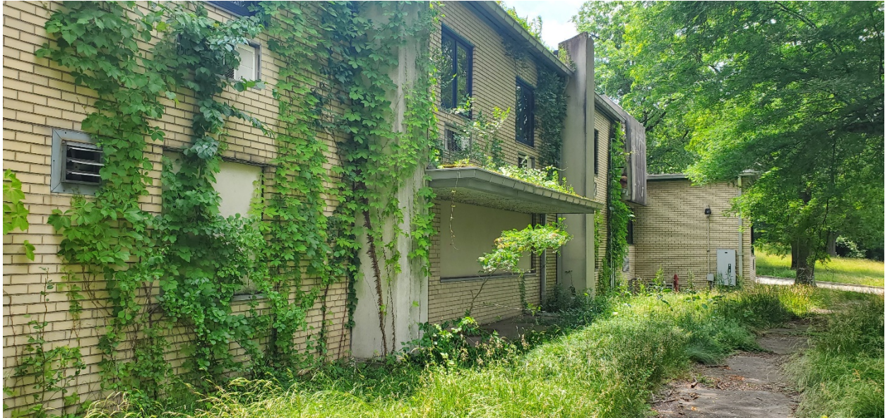
Western elevation looking south, engaged concrete columns and ivy growth