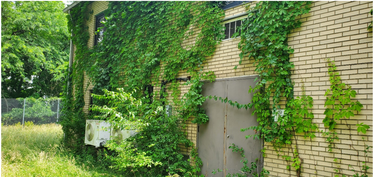
Western elevation, two-story north section, overgrown with ivy