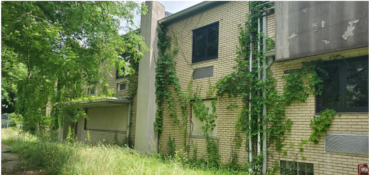
Western elevation, two-story north section with engaged concrete columns, and one-story middle bridge section with screen for HVAC