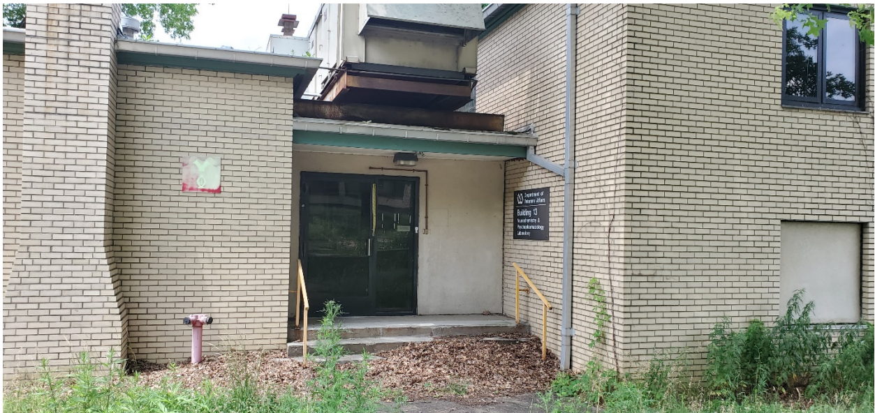
Entry bridge with mechanical system above