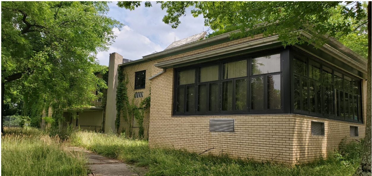
Eastern elevation, one-story south section, with continuous ribbon window