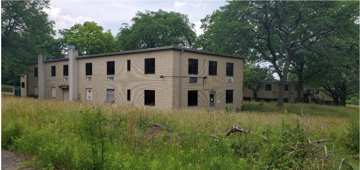
North section two-story eastern elevation with engaged concrete columns, and northern elevation