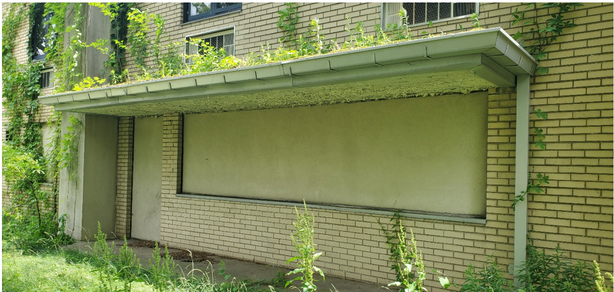
Western elevation entry door, picture window, and overgrown canopy