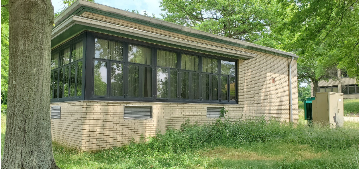
Southern elevation, one-story south section